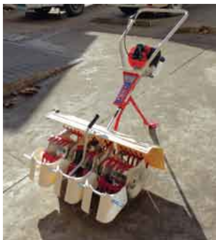
Hand and motorized mechanical weeders.