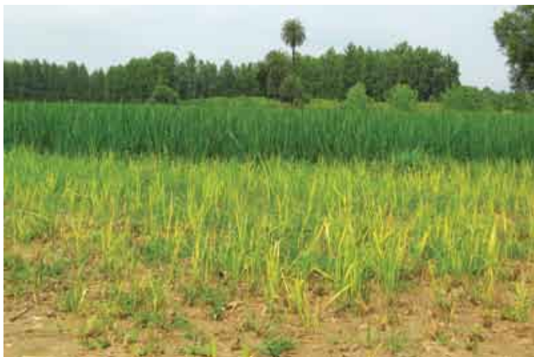
Symptoms of iron deficiency (foreground).

Dry seeded rice often suffers from iron deficiency when grown on lighter soils (sandy loams and loams), and the deficiency is worse in low-rainfall seasons. The symptoms generally appear during the early vegetative stage in the