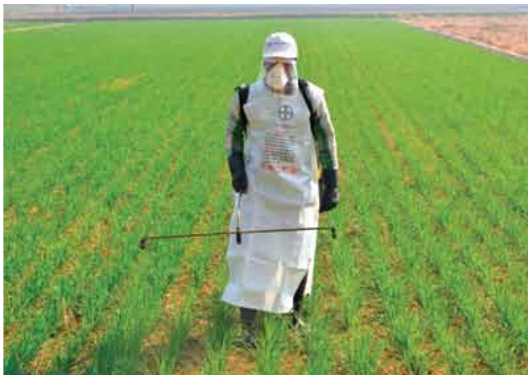
Protective clothing for spraying.

Uniform application of the spray across the entire field is needed to avoid “misses” (costly follow-up hand weeding needed) and overspraying (waste of costly chemicals). The best way of achieving this is with a multinozzle (e.g., three) boom with flat-fan nozzles and slightly overlapping spray patterns at the soil surface. The overlap is achieved by holding the boom at the right height (approximately 50 cm) above the target (for preemergence, the soil surface is the target, and for postemergence, weeds are the target, so the boom should be 50 cm above the top of weeds). Cone nozzles should not be used for herbicide application—only flat-fan nozzles are recommended.