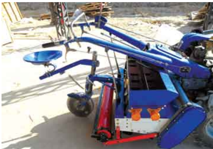
Inclined plate and fluted roller seed-cum-fertilizer drills for 2-wheel tractors.