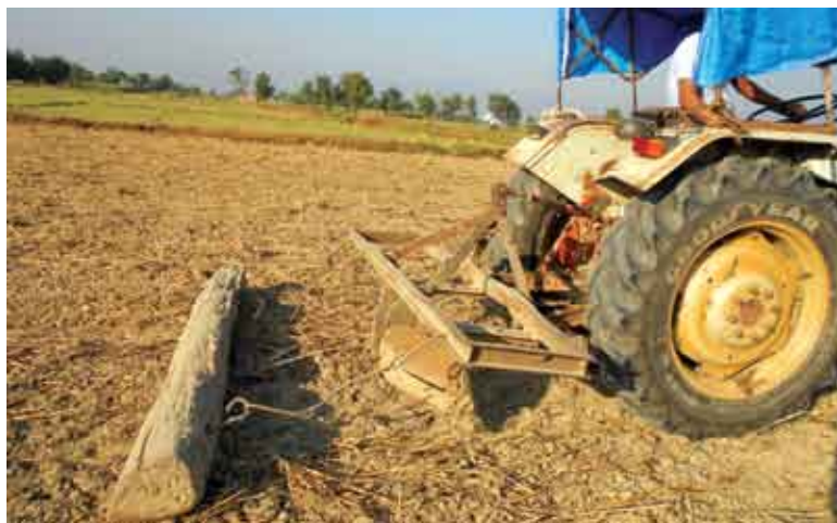
Land leveling using a scraper (Raiser) and planking