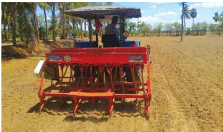
Seeding in tilled soil (CT-DSR) using a seed drill with a fluted-roller seeding mechanism.