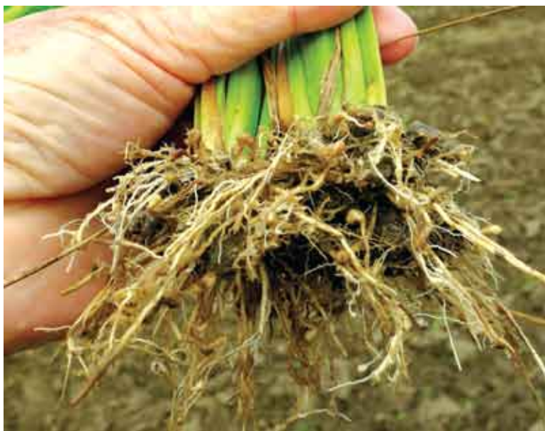
Root galls indicating nematode infestation.

form of yellowing, stunted plants, and seedling death. The crop should be sprayed with 1% ferrous sulfate solution as soon as the symptoms appear (with repeat applications after a week if the symptoms persist). For severe symptoms, try to keep the field flooded/saturated for a few days at the time of ferrous sulfate application. If iron deficiency symptoms appear later during crop growth, they may be due to cereal cyst nematodes—check the roots for galls to determine whether this is a likely cause. If galls are present, avoid using this field for DSR in the future.