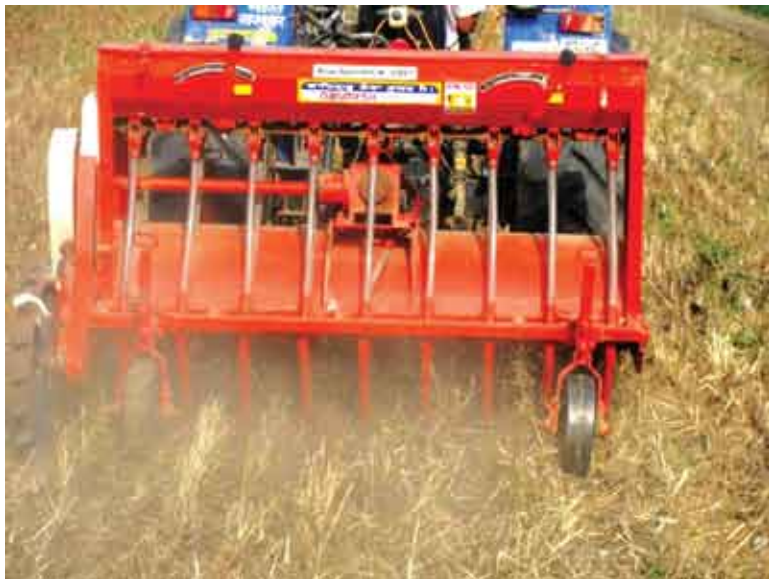
DSR being sown into residues using the Turbo Happy Seeder.

Because of the high speed of the rotary axle on these drills, no prior tillage is needed using either full or strip tillage. Some of these drills (Indian models) have an inclined-plate seeding mechanism which enables precise seeding of a range of seeds sizes (from rice and wheat to maize, lentil and chickpeas). Others (Chinese models) have fluted roller seeding mechanisms. The seed-fertilizer drills/planters for 2-wheel tractors are an improvement on the “power tiller–operated seeders” (PTOS) that have been available for some time. The standard PTOS has a seed box but no fertilizer box, and a fluted-roller seeding mechanism.