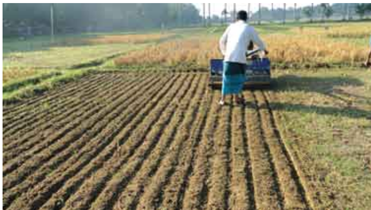
DSR seeding with strip tillage into the nontilled soil.