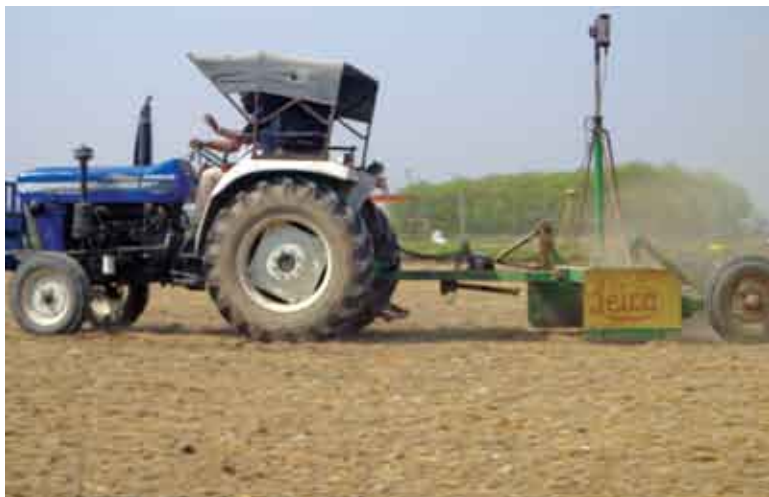
Land leveling using laser guidance

Good land leveling helps ensure high yield and reliable production of DSR. This is best achieved using laser-assisted land leveling. If laser-land leveling equipment is not available, the ploughed land should be leveled carefully using locally available land leveling equipment – a scraper ( Raiser ) and planking. A level field allows planters/drills to place seed more precisely and enables more uniform