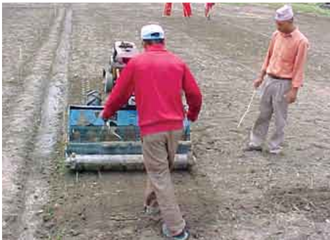
DSR seeding with full pass tillage into previously cultivated soil (“power tiller–operated seeder” - a seeder with a rotary tiller powered by a 2-wheel tractor).