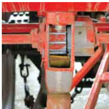
Inclined-plate (left) and fluted-roller (right) metering systems.