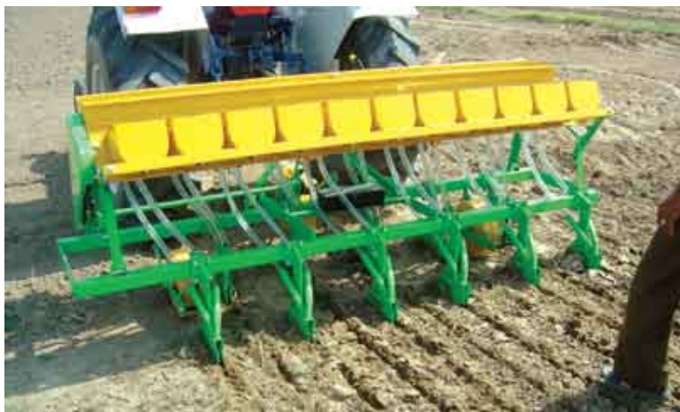
Seeding in nontilled soil (ZT-DSR) using an inclined plate seed drill.