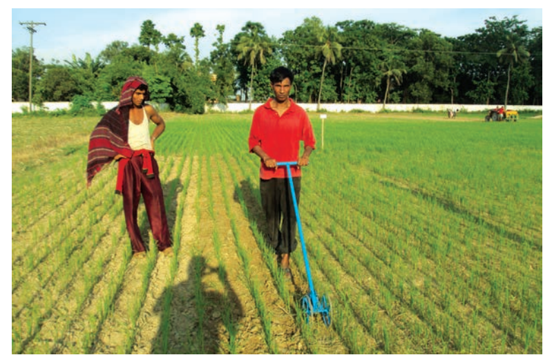
Hand-operated weeder for in-row weed control in DSR

Physical weed control consists of removing weeds by hand (manual weeding) or by machine (mechanical weeding). It is practically and economically impossible to control weeds solely by hand weeding because of labor scarcity and rising labor wages. However, one or two spot hand weedings are strongly recommended to remove weeds that escape herbicide application, to prevent weed seed production and the accumulation of weed seeds in the soil. Mechanical weeding can be useful in reducing labor use in weeding. Motorized cono weeders and other hand weeders are available in the region and can be included as part of integrated weed management.